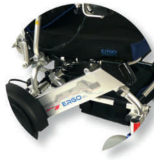
Autonomy 30 km