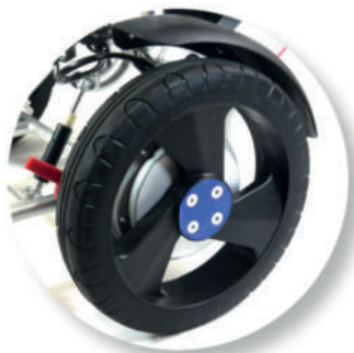
Back wheel 10 inches