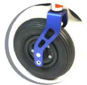
Aluminium Fork Blue design