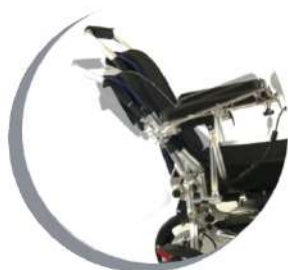
Reclining Back 3 positions