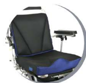
Comfort Seat dual-density