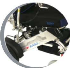
Double Battery Autonomy: 30km