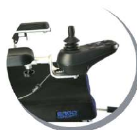
Adjustable Joystick 4 positions