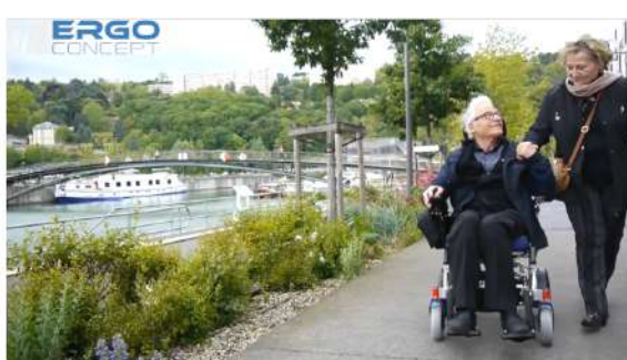
The couple goes for a ride