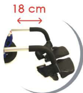
Adjustable Footrest double-pallet