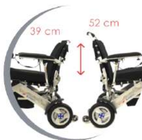
Adjustable Backrest in height