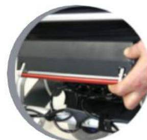
Foldable in one gesture en 3 secondes