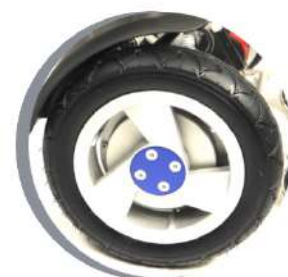
Back Wheel 10 inches